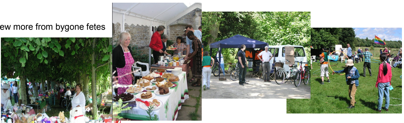
A few more from bygone fetes